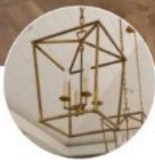
Darlana Pendant Lantern Mix and match your lighting styles with different sizes and finishes.