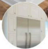
Cabinets Flush with Appliances Build a streamlined kitchen by placing appliances flush with your cabinetry.